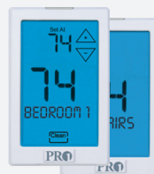
Indoor Remote (optional)